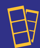
PHOTO BOOTH SPONSORSHIP (exclusive)

Engage attendees in a fun and interactive way with a branded Photo Booth experience, creating moments they'll share long after the event.